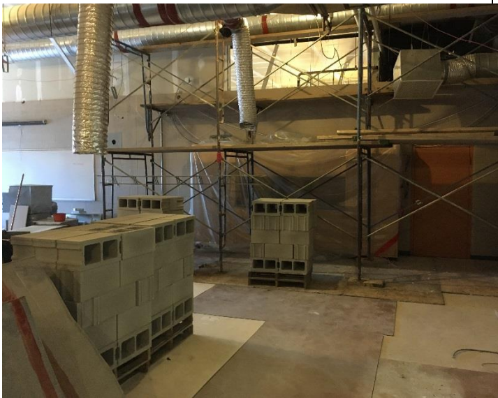
Rm. 210 Shear Wall Staged Block 7-18-18