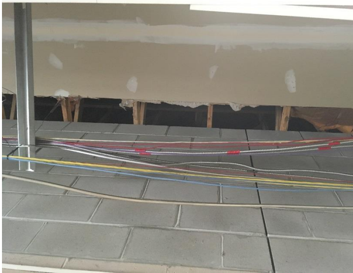
Rm. 200 Shear Wall Block & Trusses 7-19-18