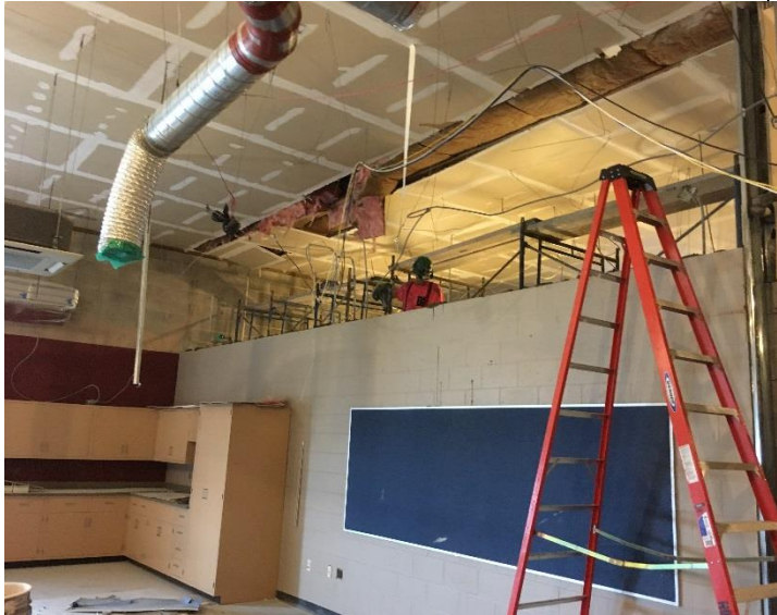
Rm.210 CMU Grout Placement 7-24-18 (2)