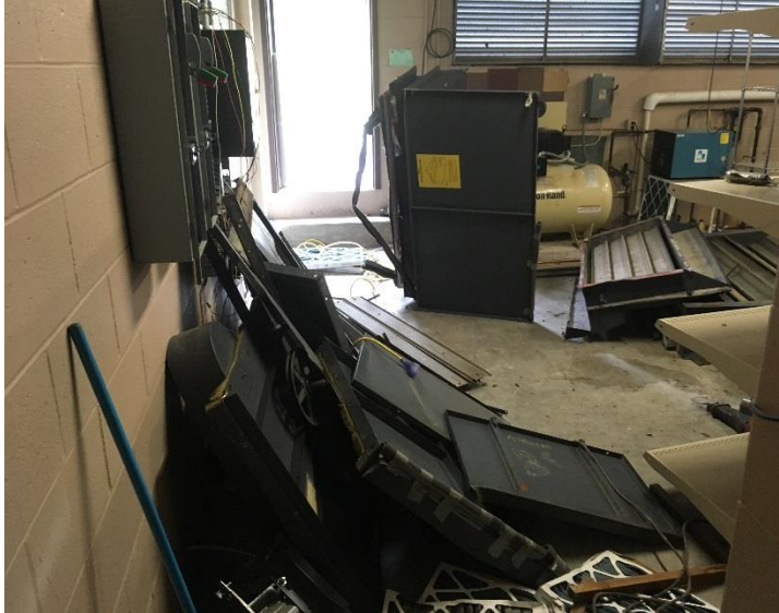
2nd Fl. Mech. Rm. Duct Demo 7-24-18 (2)