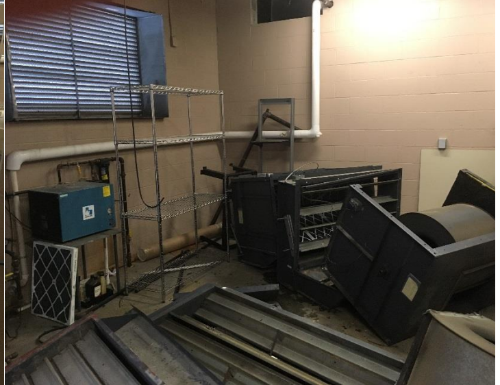
Rm.210 CMU Grout Placement 7-24-18 (1)