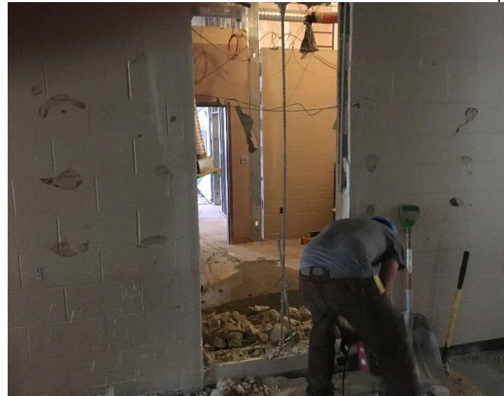
Rm.230 Block Demo For New Door 7-24-18