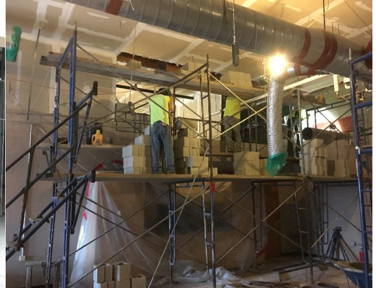
Rm.228 Shear Wall Block 7-24-18