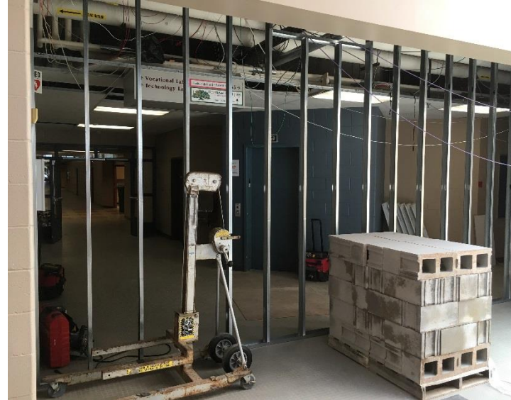
Main Lobby Temp Construction Wall 7-25-18