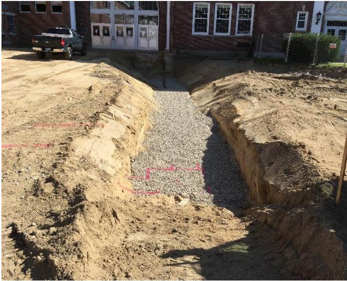
Stone Base For Concrete Footings Below Bridge 9-04-18 (2)