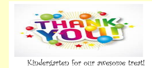
Kindergarten for our awesome treat!